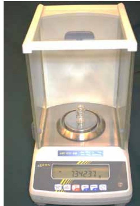
Figure (2): Weighing of the vials using sensitive electronic balance.

ance to obtain the final weight of the vial containing the extruded debris; this value represented the post-instrumentation weight (Figure 2). The weight of extruded debris was then calculated by subtracting the pre-instrumentation weight from the post-instrumentation weight of each collecting vial. The amount of extruded debris was analyzed statistically using the One-way analysis of variance test (ANOVA) and Tukey's post hoc test for multiple comparisons at a significance level of p < 0.05 .